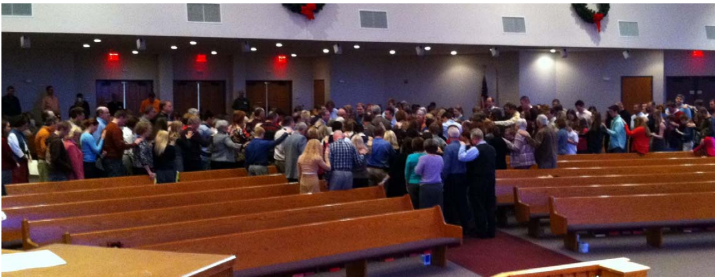
Commissioning the Alabama Mission Team during the 9:40 a.m. service on Sunday, January 8th.